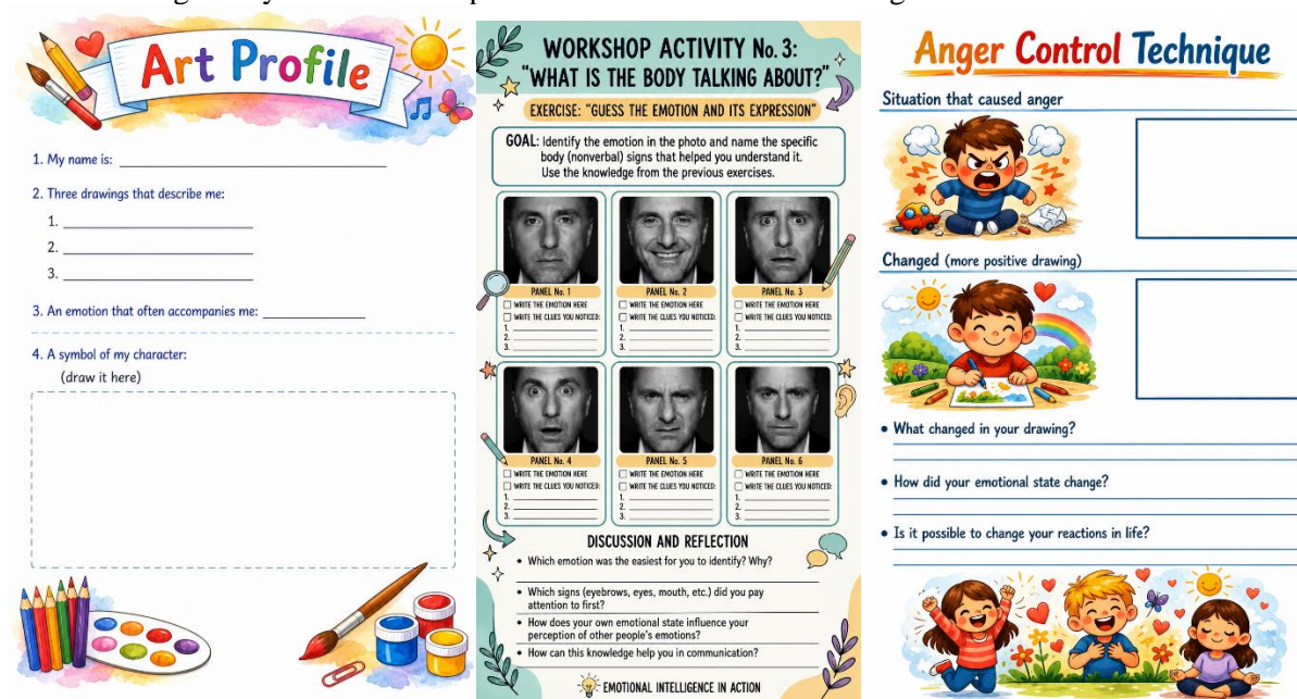
Fig. 2. Sample worksheets for training sessions 1,3,5.

In Figure 2 you can see samples of worksheets for the training sessions.